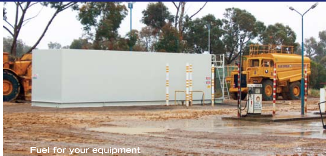
Fuel for your equipment