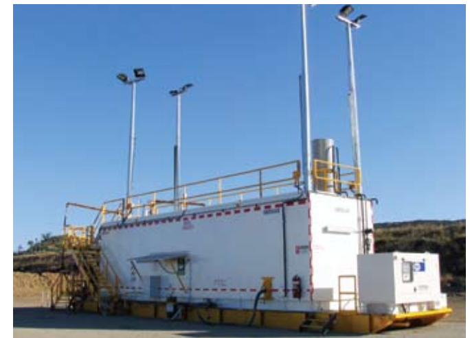
FULL TURNKEY INSTALLATIONS