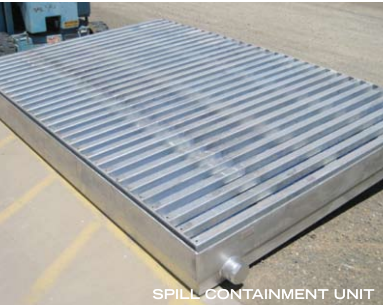
SPILL CONTAINMENT UNIT