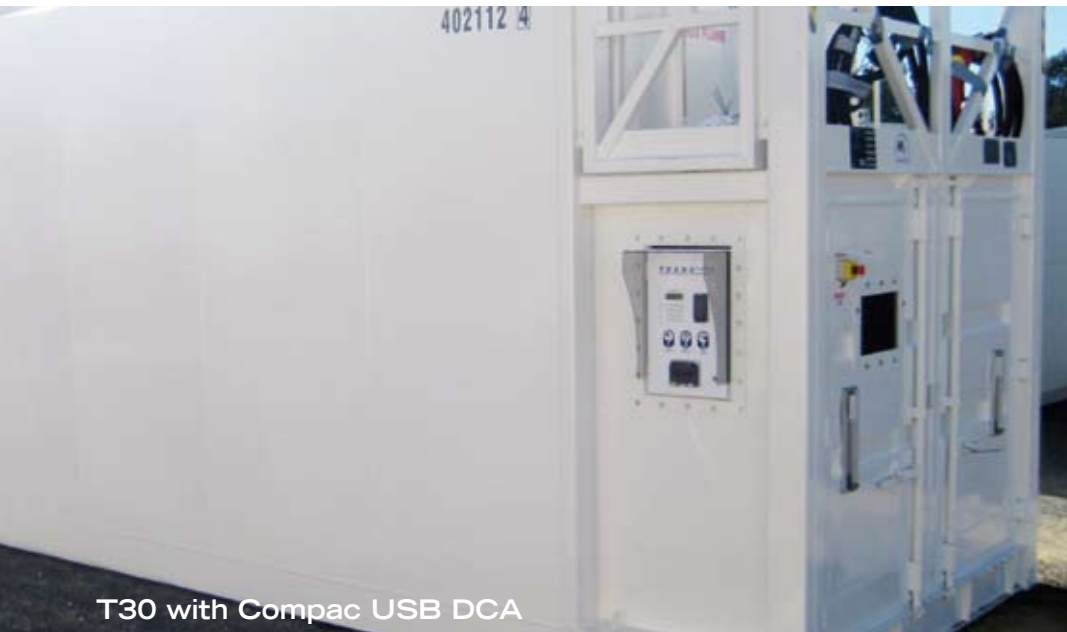
T30 with Compac USB DCA

In a world driven by profitability, efficiency and sustainability; a fuel management system can help you get the most from your Transtank fuel storage solution.