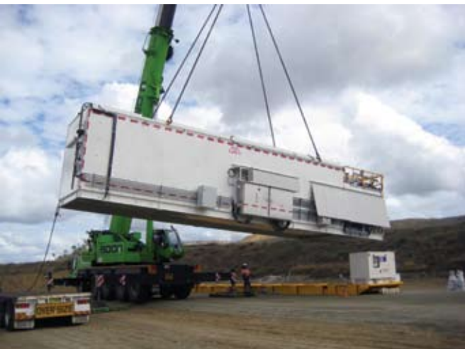
UNLOADING AND POSITIONING