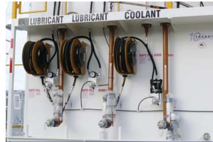
LUBRICANTS & WASTE OIL

Configured with a 100nb male Camlock with up to 1100lpm discharge rate.