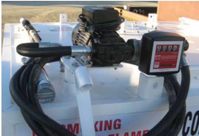
SMALL FLEET REFUELLING

Hand, Rotary, 12V DC, 24V DC or 240V AC models available to flow rates of 80lpm.