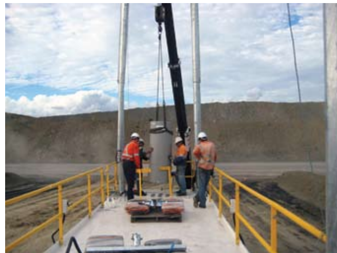
INSTALLATION, COMMISSIONING AND TRAINING