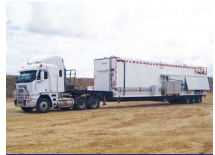
TRANSPORT TO SITE