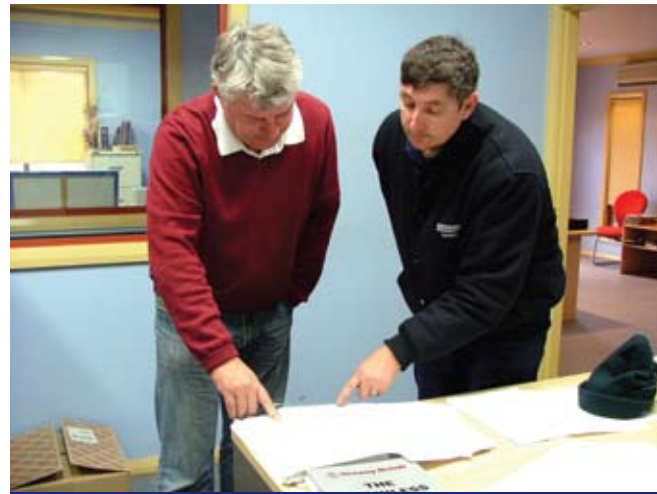
DESIGN, APPROVALS AND RISK ASSESSMENT