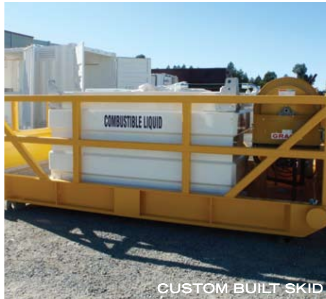
CUSTOM BUILT SKID