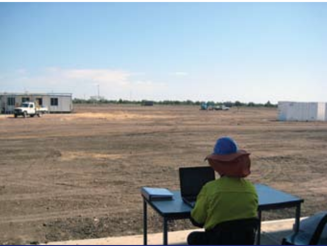
SITE AND PROJECT EVALUATIONS