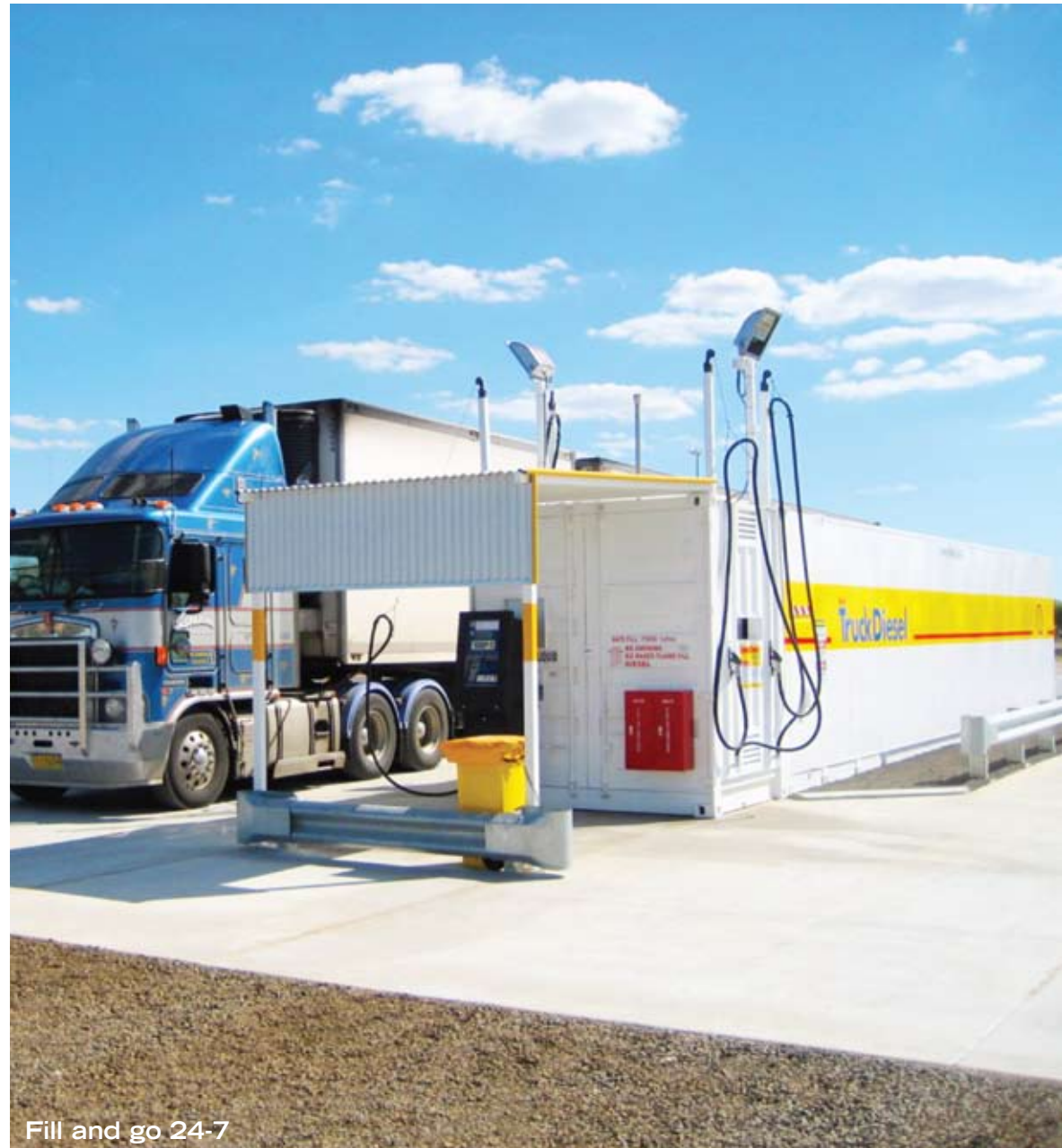
Fill and go 24-7