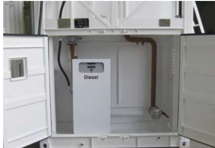
HOME BASE REFUELLING

Hand, Rotary, 12V DC, 24V DC or 240V AC models available to flow rates of 80lpm.